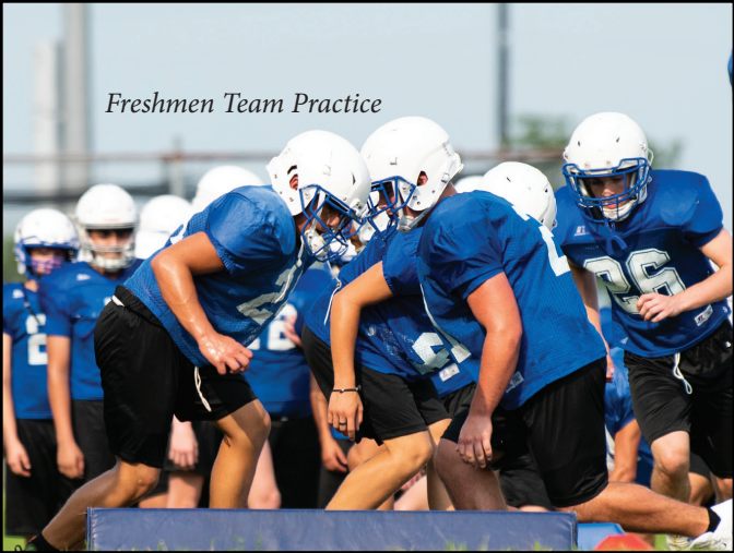
Freshmen Team Practice