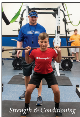
Strength & Conditioning