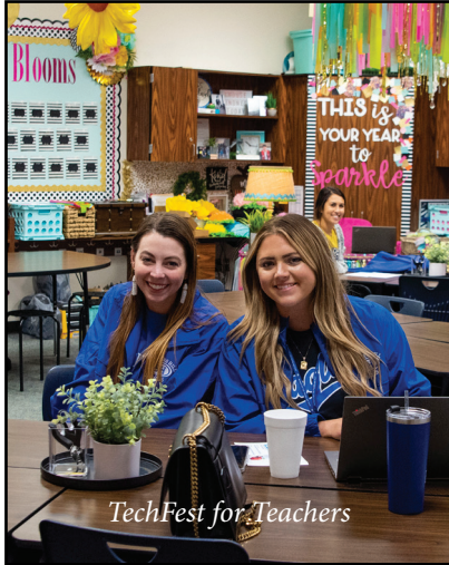
TechFest for Teachers