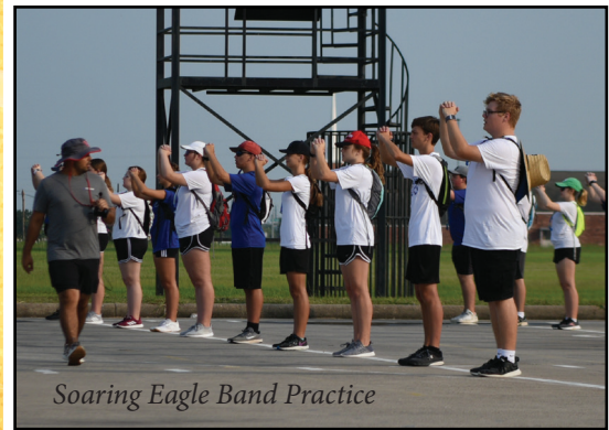
Soaring Eagle Band Practice