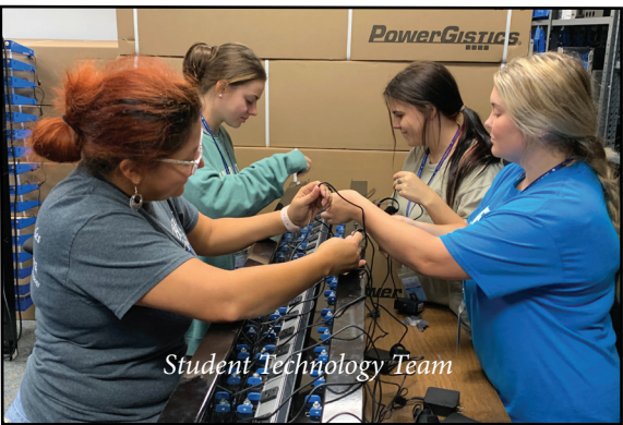
Student Technology Team