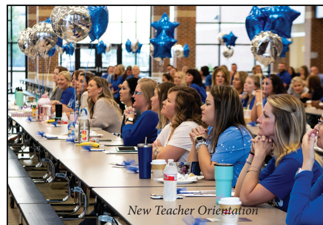
New Teacher Orientation