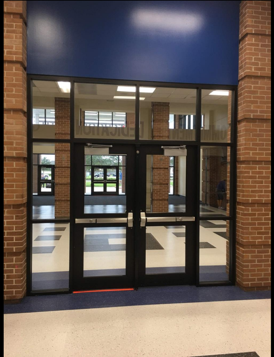
Middle School North Main Corridor & Vestibule