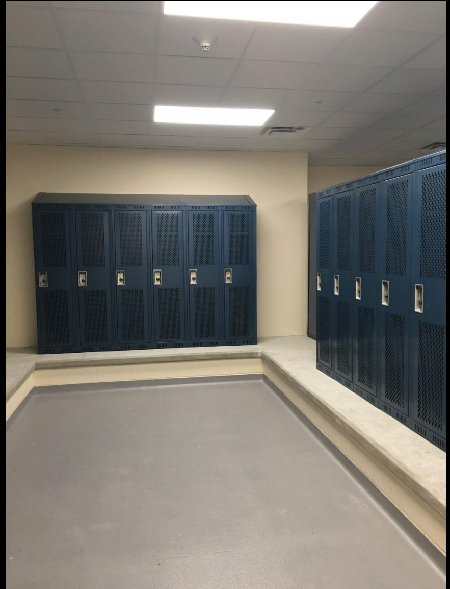
Multi-Purpose Baseball-Softball Locker Room