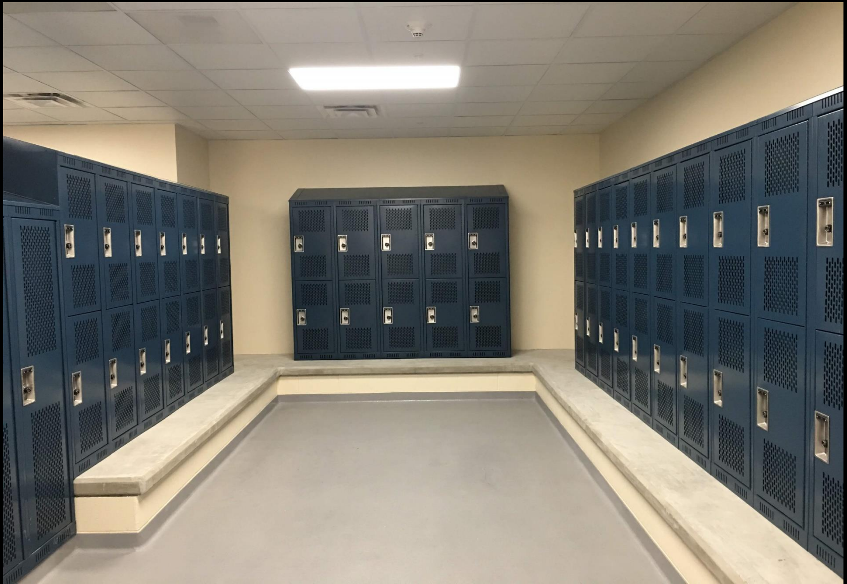
Multi-Purpose Baseball-Softball Locker Room