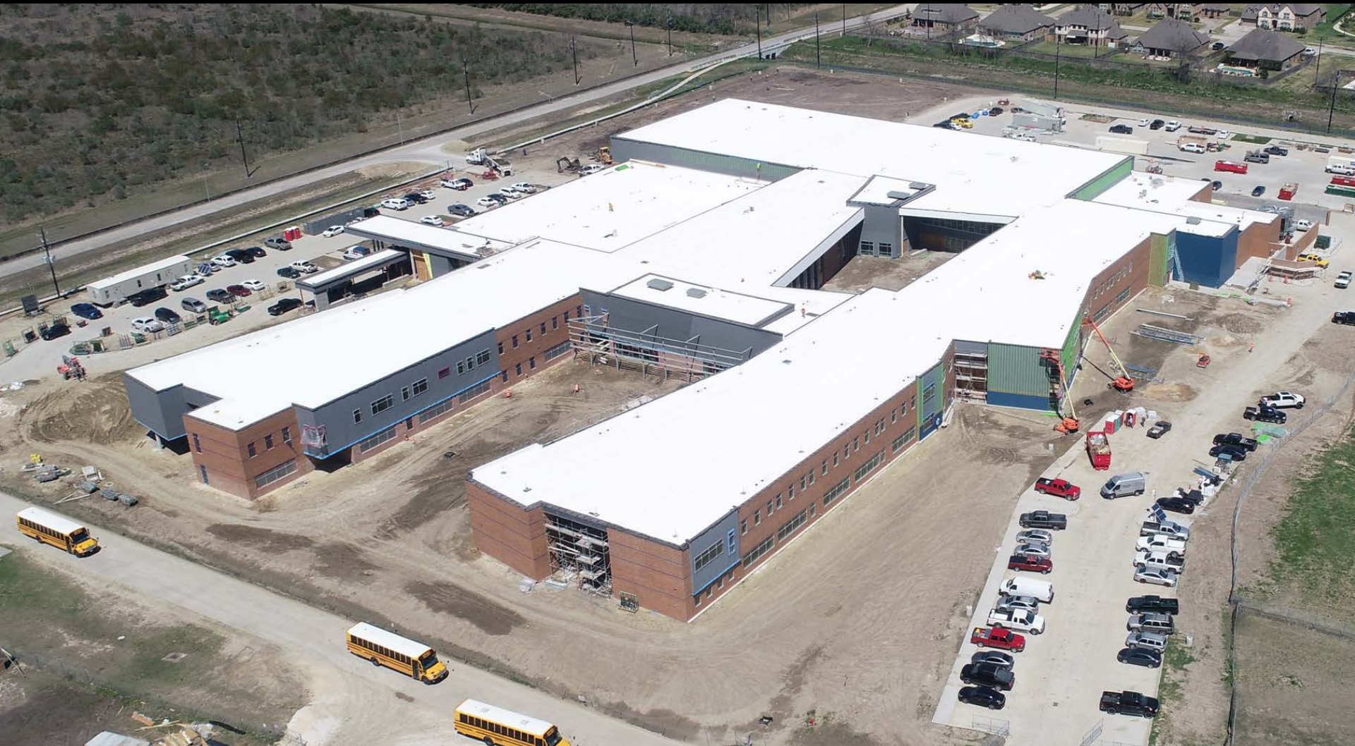
4 TH – 5 TH GRADE CLASSROOM WING VIEW LOOKING N.E.