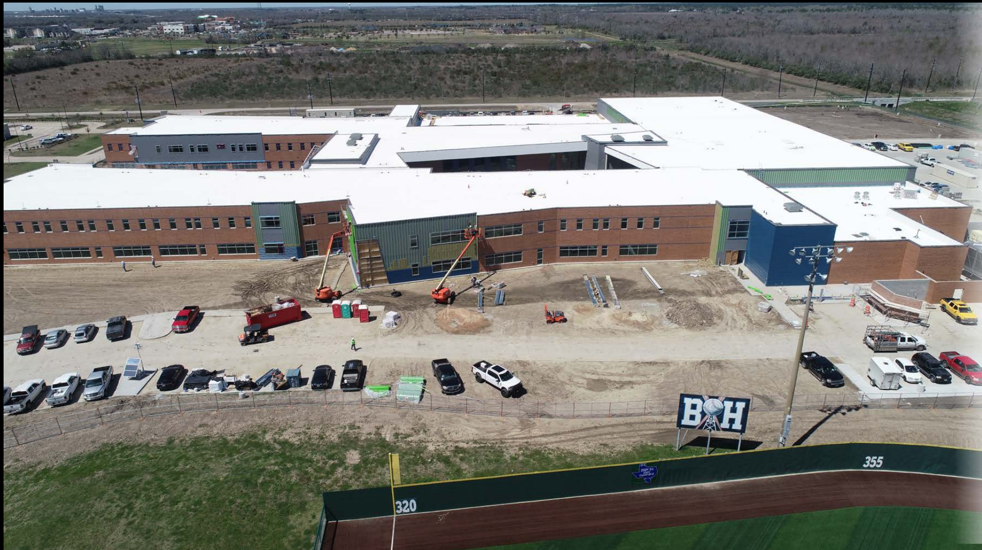
4 TH – 5 TH GRADE CLASSROOM WING VIEW LOOKING NORTH