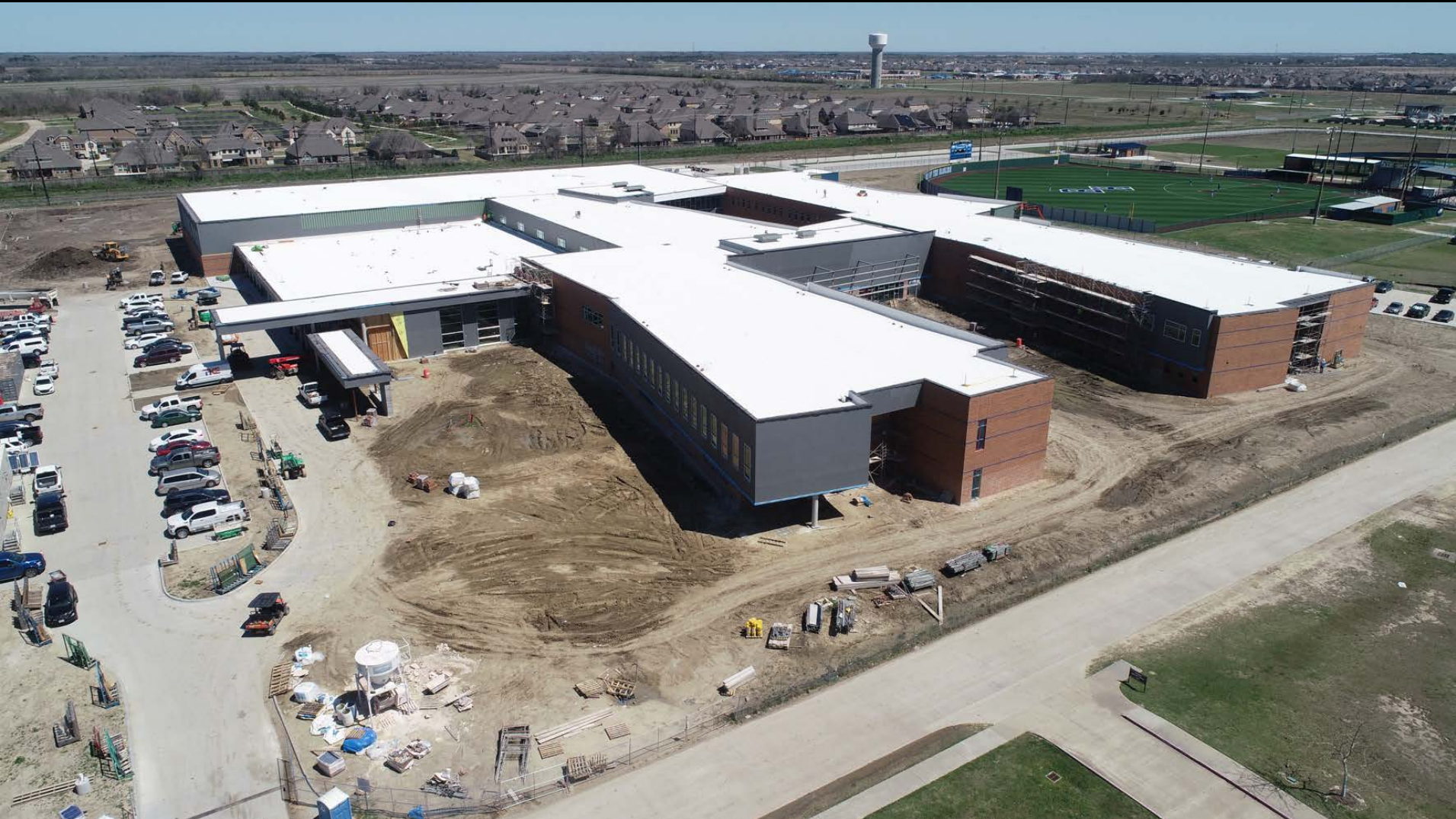
6 TH GRADE WING, VIEW LOOKING EAST