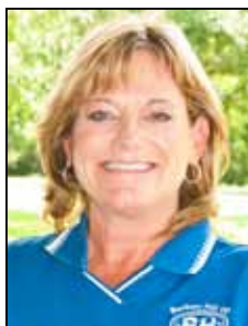
Elementary Principal of the Year