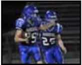
Varsity Football Schedule p. 5