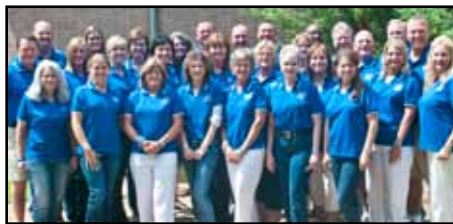
BHISD Leadership Team during training this summer.

100% of our teachers received high-quality professional development in accordance with NCLB standards. We congratulate all of our teachers for meeting and exceeding the level of quality required at the local, state, and national levels.