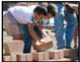
BH Primary Gardeners pp. 6-7