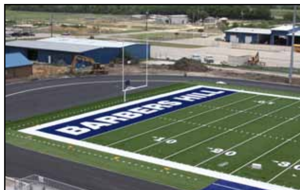
Artificial turf approved by voters in the May bond election was installed this summer at Eagle Stadium. The installation process required many steps ... but the results bring a lot of Eagle Pride!