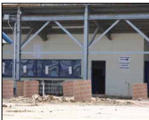
The visitor side of Eagle Stadium received upgrades this summer thanks to bond support in BHISD.