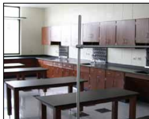
Four new Science classrooms at Barbers Hill Middle will welcome students on August 22nd.