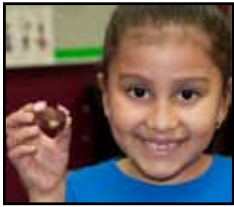
Radish mice are the best!

She developed a budget that would encompass a much larger garden: planting in the fall, carrots, lettuce and broccoli in winter, and tomatoes, corn and watermelon in spring. Each second-grader would have a small plot. She received the go-ahead from administrators and began making phone calls.