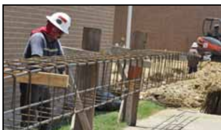
Work began on the Auxilliary field restrooms and concession stand in early June.

District facility improvements and maintenance projects have been numerous this summer in preparation for another excellent school year. These include the opening of a new Middle School science wing, Middle School HVAC upgrades, new Primary School fire sprinkler system, as well as the athletic upgrades at Eagle Stadium and the Auxiliary Field. In addition, to keep the buses rolling, the Transportation Department mechan-