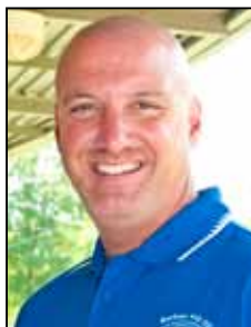
Secondary Principal of the Year