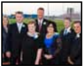
Region 4 Honor Board p. 3